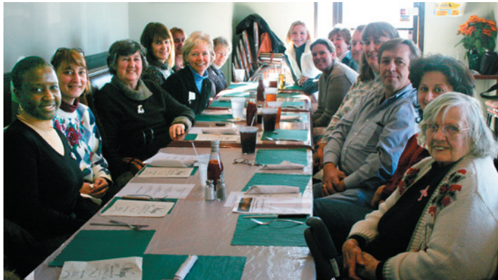
Group luncheon followed the business meeting at the Wings Restaurant